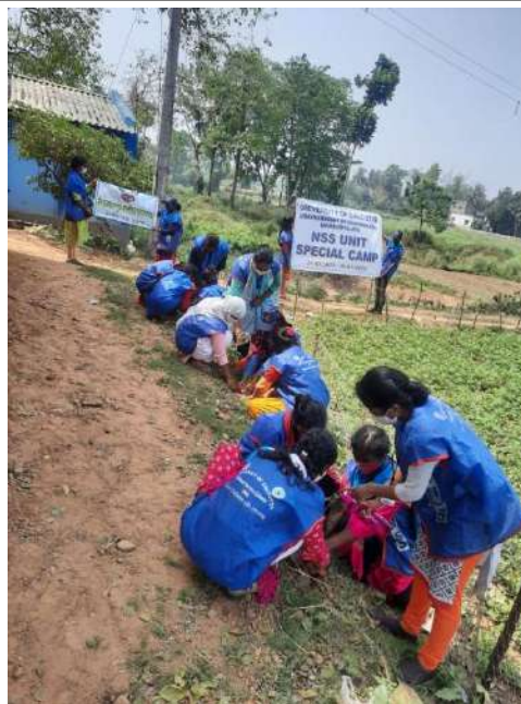
Tree Plantation in the adopted village, Kurchi