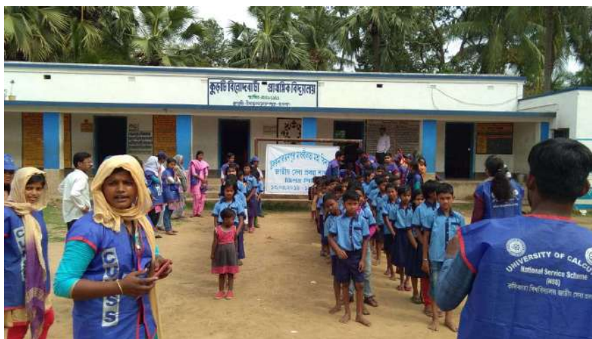
Entertaining children through cultural activities.

23.01.22 Birth Day Celebration of NetajiSubhas Chandra Bose