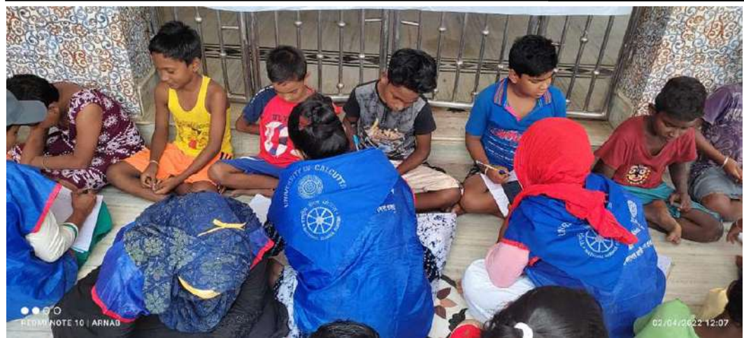
Child education and distribution of educational aids among children.