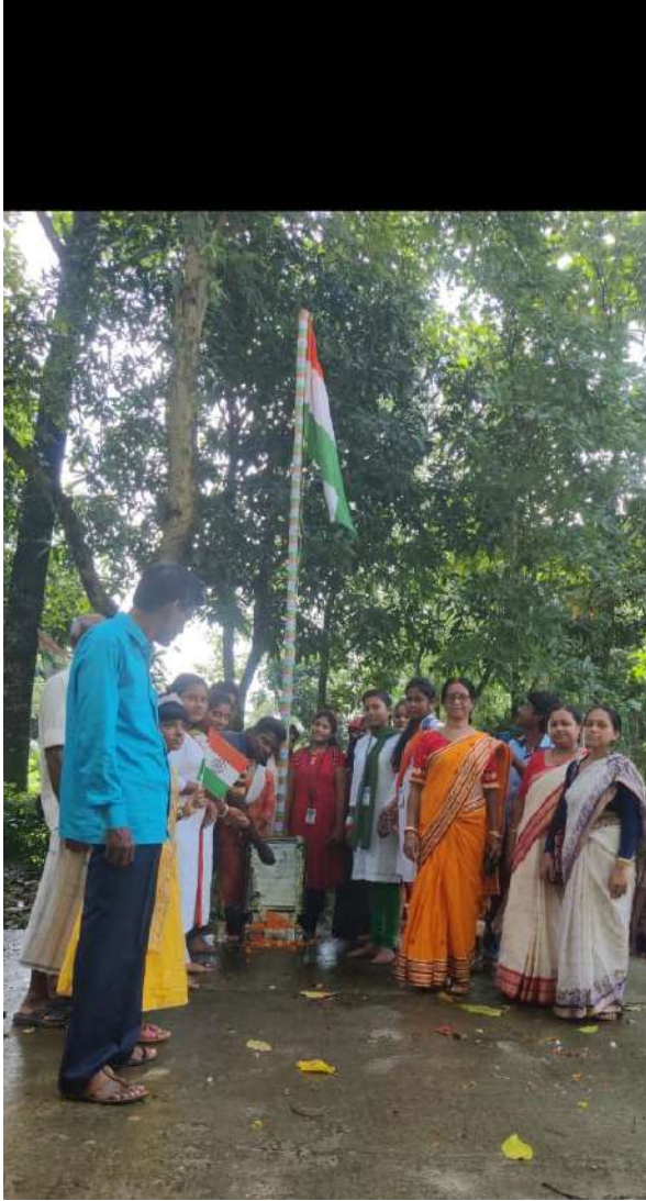
🇮🇳 15.08.18 Independence Day Celebration